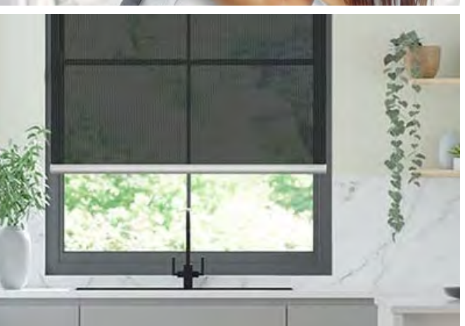
Choose the perfect colour for your interior space